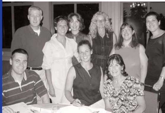
Our esteemed Board of Directors